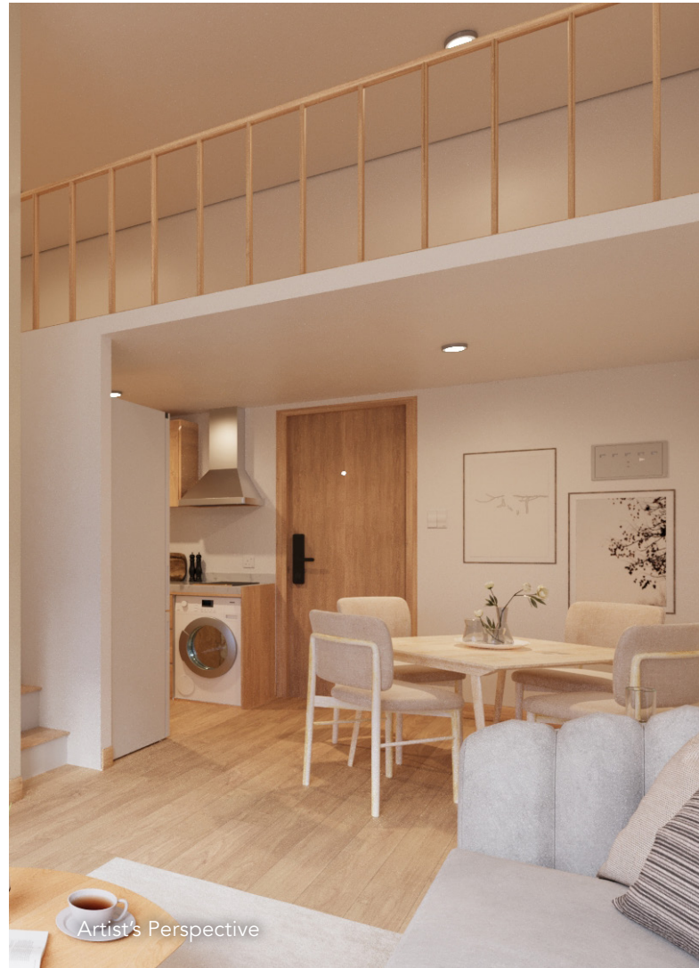
1 BEDROOM WITH EXTRA UNIT SPACE