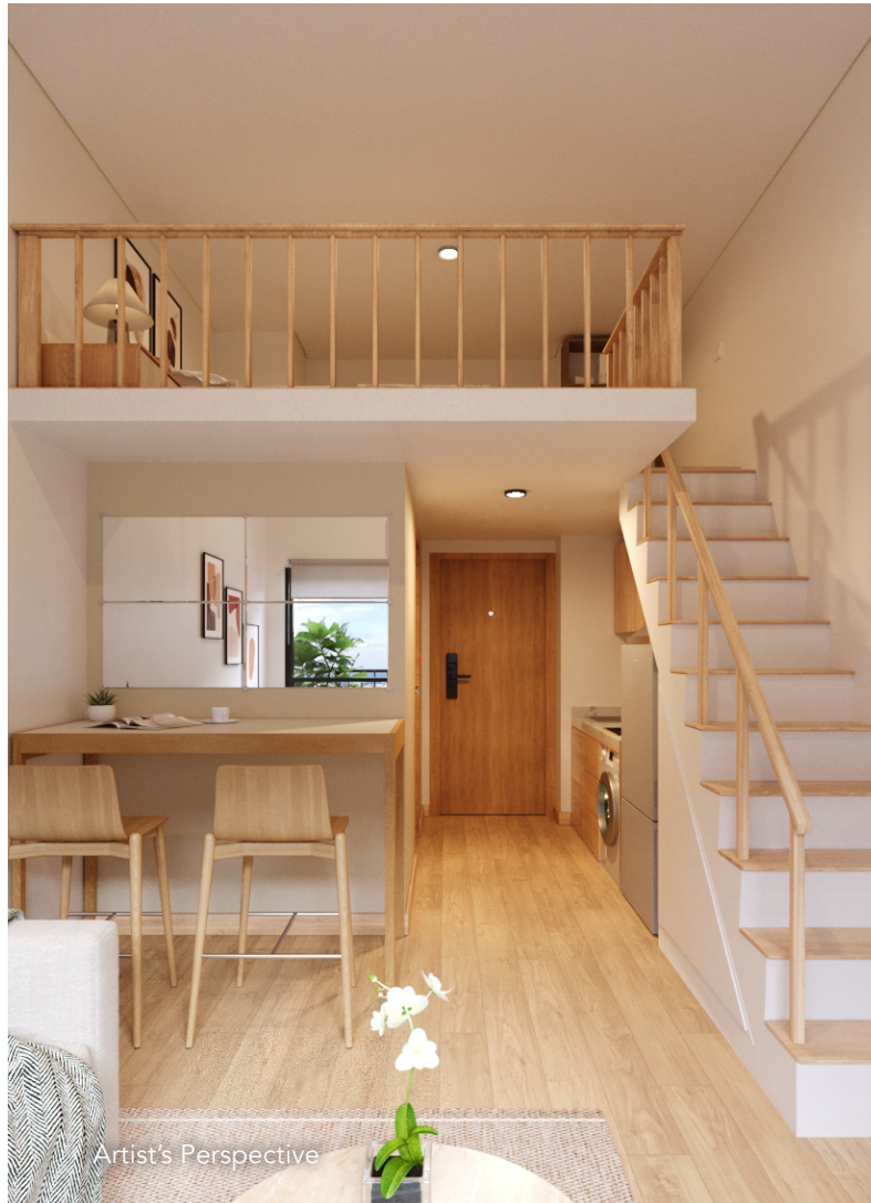
STUDIO WITH EXTRA UNIT SPACE