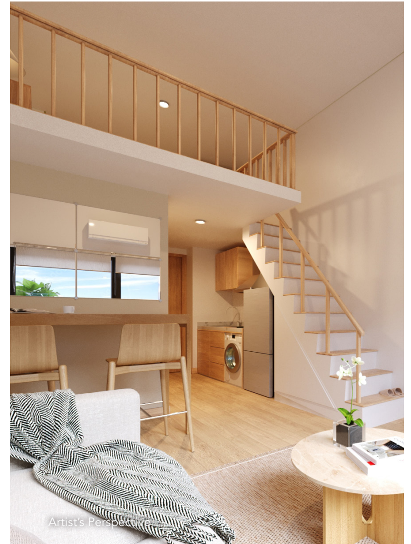
2 BEDROOM WITH EXTRA UNIT SPACE